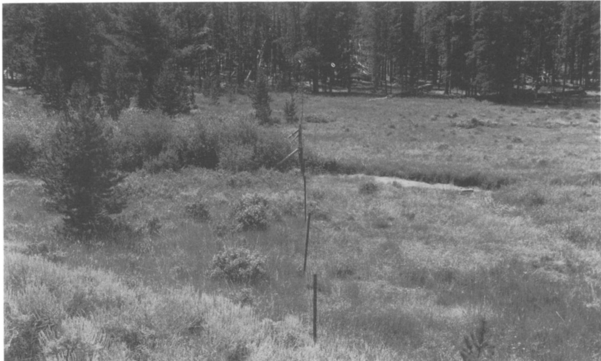
Fig. 2. Fenceline contrast of Sheep Creek in 1985: the right side is grazed; the left side is inside the exclosure.

Over the 2-year sampling period, willow cover averaged 8 1/2 times greater ( P=0.004 ) in the exclosures than in adjacent grazed areas (Table 3). Tufted hairgrass ( Deschampsia caespitosa (L.) Beauv.) cover was similar ( P>0.2 ) between treatments. The grazed areas had 9 times ( P=0.007 ) as much clover ( Trifolium repens L.) cover as the exclosures, while dandelion ( Taraxacum officinale